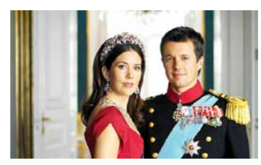
Danish Crown Prince Frederik and Crown Princess Mary

The Crown Prince and Crown Princess graced the opening of the Rotary International Convention at the Bella Center in Copenhagen 2006 with their presence. Now we are honoured by their attendance at our Friday luncheon, September 19. Mark the date in your calendar now and be sure not to miss a special occasion in our club.